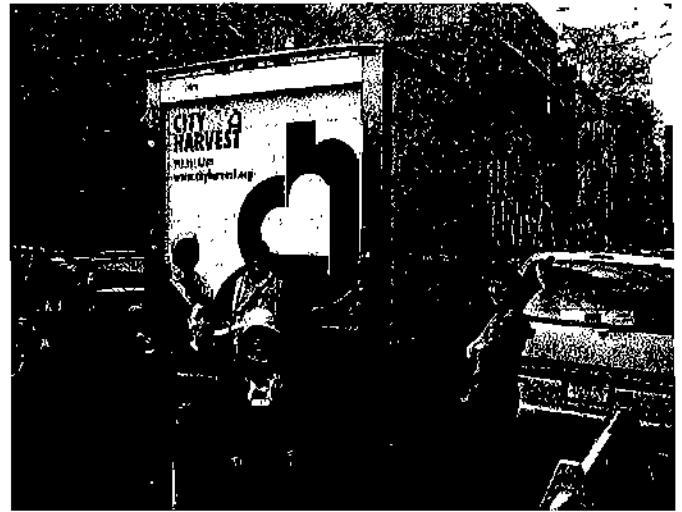
Some of our Food for Families group just loaded the City Harvest Truck